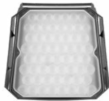
Magnum Multi Battery XS 2300 lm