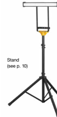
Stand (see p. 10)