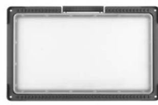
Magnum Multi Battery L 9250 lm