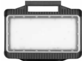
Magnum Multi Battery M 4050 lm